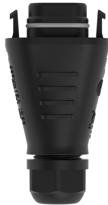
HMS Field Connector

HMS Field Connector is designed for the situation where a PV system only has one microinverter. It provides a quick and simple electrical connection between the microinverter and the grid by serving as a joining component.